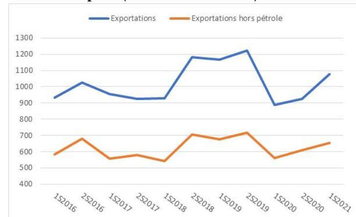
Trends in exports (in billion CFA francs)

The increase in export earnings is attributable to improved sales of some major export products. These are mainly crude petroleum oils which increased by 30.7%; raw cocoa beans (34.2%); raw cotton (59.3%); sawn timber (6.6%) and logs (13.8%).