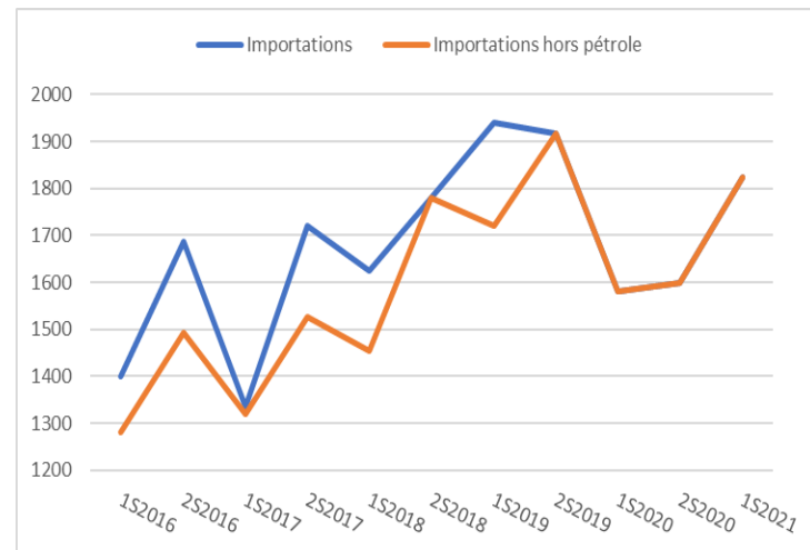
Trends in imports (in billion CFA francs)

This trend was cushioned by the drop in import expenditure for fuels and lubricants (-9%), fish and shellfish (-18%).